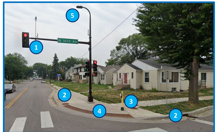
Example Illustration – Exact designs vary by location

The project will also remove vehicle access to Cedar Avenue from the existing Parkway frontage road north of the intersection. All driveway access will remain open. Full access at the Cedar Avenue & Minnehaha Parkway traffic signal will be maintained following the project.