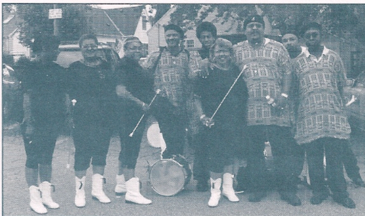
Sabathanites Drum Corps

Thanks to everyone who helped make these community events possible.