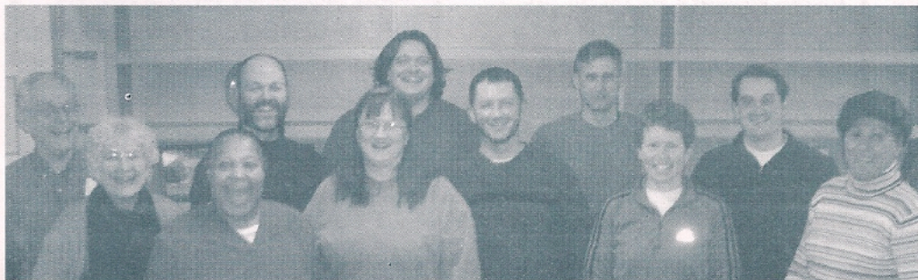
FRNNG's 2008 Board of Directors from left to right:

Thank you to all our 2008 FRNNG Board of Directors for your hard work and past accomplishments.