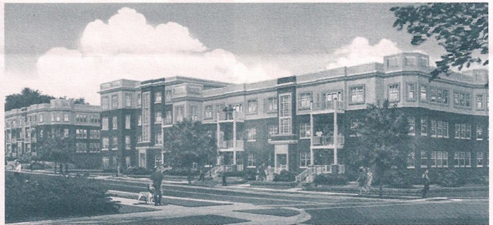
Architect's rendering of proposed Applewood Pointe Cooperative

An informational meeting with home tours will be held Tuesday September 20 at 10 am at Applewood Pointe of Bloomington Southtown, 8100 Russell Ave. S., Bloomington, MN 55431. If you would like to attend, RSVP by calling 952-884-6400 or email info@applewoodpointe.com for additional information.