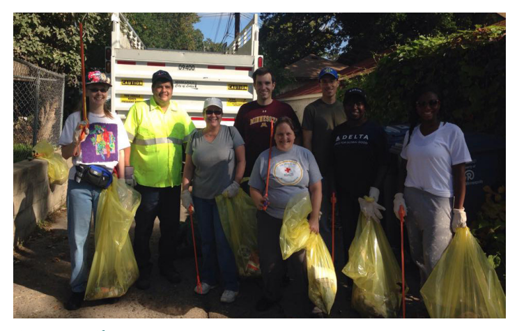
Operation Clean Sweep in action

Did you experience the benefits of 'CleanSweep'? On Saturday, September 20th, volunteers spent over three hours helping 11 blocks clear out and clean-up! In coordination with Minneapolis' solid waste department, we removed large quantities of unwanted debris, mitigated graffiti and picked up litter along our streets!