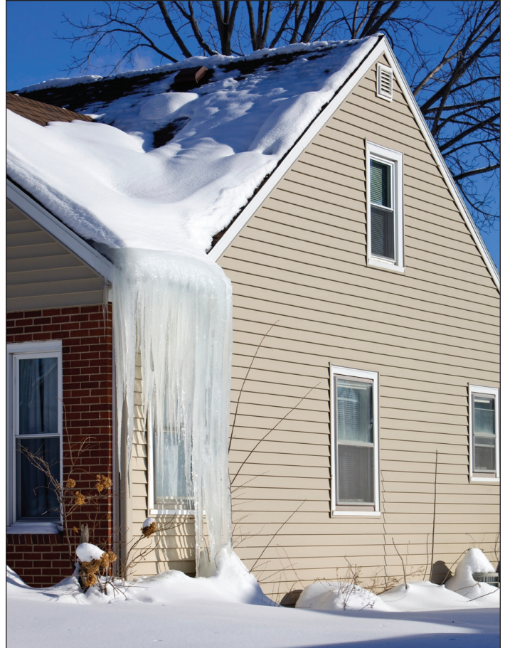
Ice dams result from the freezing and refreezing of melted snow.

Home Energy Squad Enhanced visits are a home energy evaluation offered in Minneapolis. The program is provided by CenterPoint Energy and Xcel Energy in partnership with the nonprofit Center for Energy and Environment (CEE). At the home energy visit, two energy consultants visit your home to help you identify ways to save energy. During the two-hour consultation, diagnostic tests are completed that include an insulation inspection and a blower door test to measure your home for air leaks. These tests are essential to learning how to help prevent ice dams. The cost for the visit to FRN residents