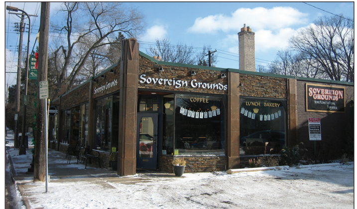
Sovereign Grounds Playground & Coffeehouse, 813 East 48th Street, is a gathering place for people from around the metro area as well as neighbors.

The city of Minneapolis supports business initiatives such as improving properties and hiring employees. One program that is related to this effort is the Great