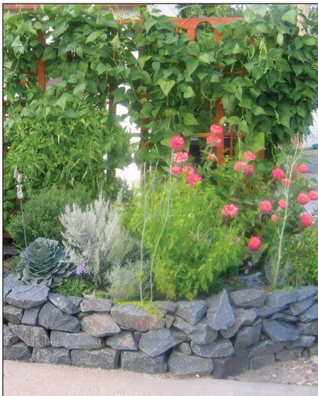
Zinnias thrive in Carol Warner's award-winning garden in Northrop.