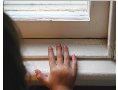
Hazardous lead-based paint was commonly used on surfaces inside and outside homes built before 1978.

out windows and can be easily exposed to lead dust in these areas.