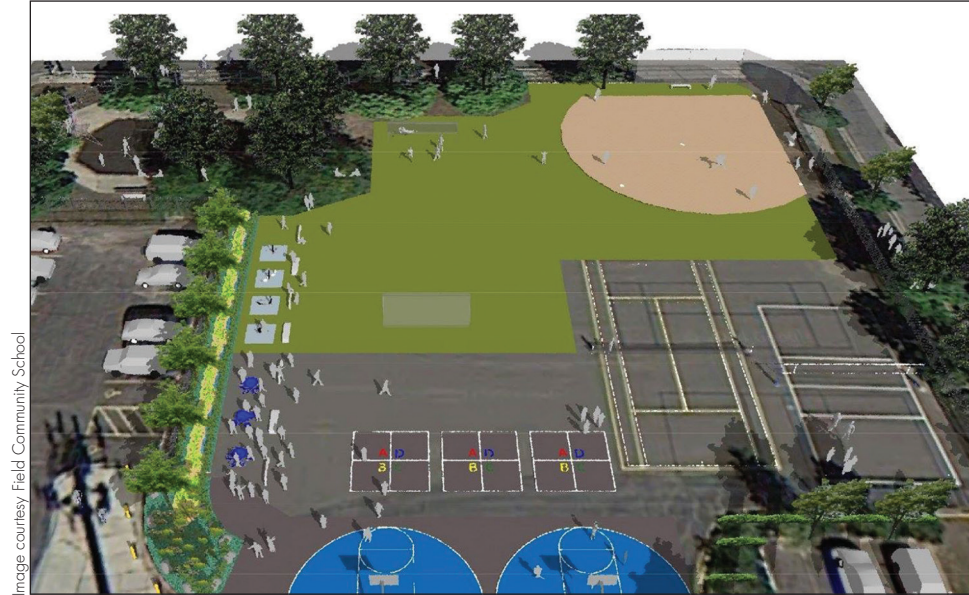
A view looking north toward 46th Street of proposed renovations to the playground at Field Community School.

Construction dates have yet to be determined. More information will be made available in the future. ❖