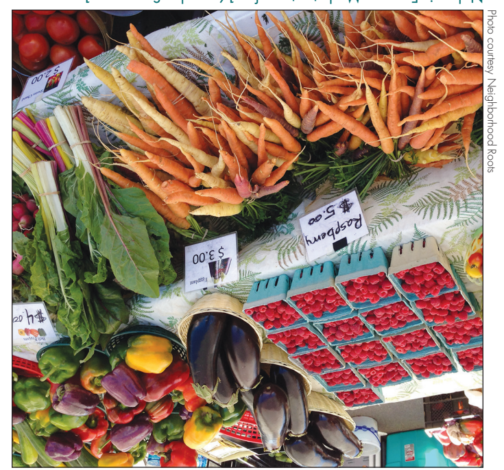
Nokomis Farmers Market returns for 16 weeks. See page 1.

Close to Home is written for neighbors by neighbors. The next deadline is Friday, April 3. Please email articles & images to: communications@frnng.org