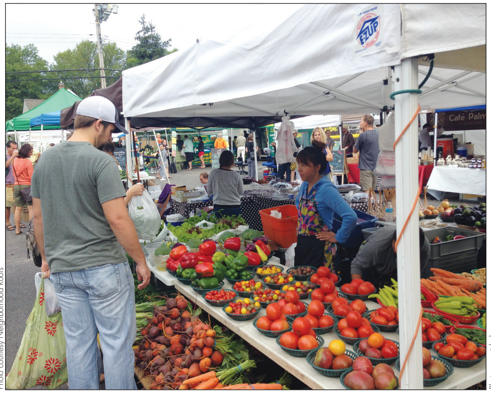
Nokomis Farmers Market looks forward to a 16-week season at 52nd and Chicago Avenue in 2015.