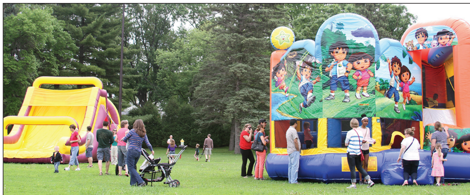
A bouncy castle, pony rides, dunk tank, ring toss, and other carnival games will be among the playful activities for young neighbors at the 50th-Anniversary Celebration of our neighborhood.