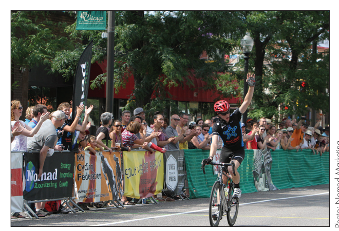
Hundreds of spectators watch the drama of speeding bicyclists soar through our neighborhood.

One of most popular spectator events in south Minneapolis, the 2014 Southside Sprint was the largest amateur road bicycle race in Minnesota for the third consecutive year. Nearly