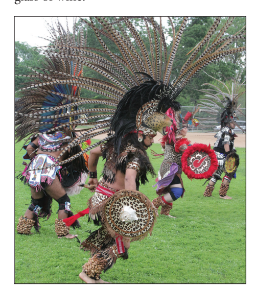
Aztec Dancers will again thrill the audience.

The party will continue on into the evening with a private neighborhood reception at Turtle Bread Company. Due to limited seating, the first 100 neighbors to RSVP will obtain a free ticket. Please RSVP by May 15 by emailing frnng@frnng.org, by calling the office at (612) 721-5424, or by contacting us on social media to indicate how many tickets you would like. To help celebrate our 50th anniversary, Turtle Bread will be giving attendees ages 55 and older a free glass of wine.