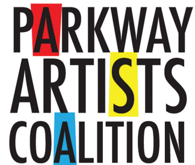
Logo design: Sarah Golden

To learn more about PAC, go online to these sources: facebook.com/ParkwayArtists www.parkwayartists.blogspot.com