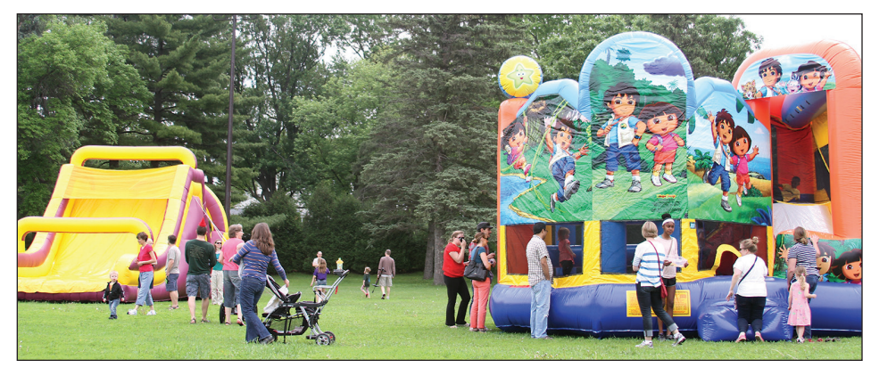
A bouncy castle, pony rides, dunk tank, ring toss, and other carnival games will be among the playful activities for young neighbors at the 50th-Anniversary Celebration of our neighborhood.