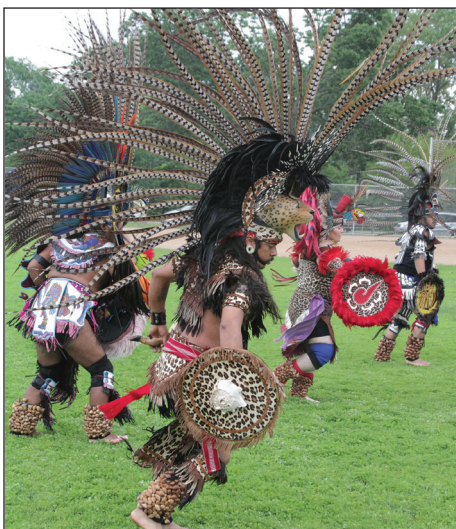
Aztec Dancers will again thrill the audience.

The party will continue on into the evening with a private neighborhood reception at Turtle Bread Company. Due to limited seating, the first 100 neighbors to RSVP will obtain a free ticket. Please RSVP by May 15 by emailing frnng@frnng.org , by calling the office at (612) 721-5424, or by contacting us on social media to indicate how many tickets you would like. To help celebrate our 50th anniversary, Turtle Bread will be giving attendees ages 55 and older a free glass of wine.