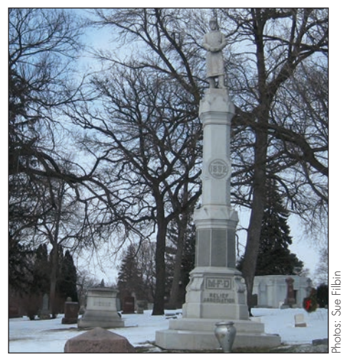
One distinctive memorial in the cemetery honors firefighters from the City of Minneapolis.