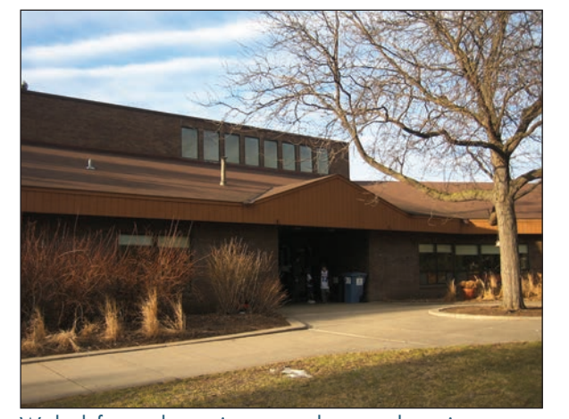
We look forward to seeing you at the annual meeting on Thursday, April 28, 6 p.m. at McRae Park.