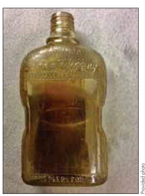
Front side of a "Golden Wedding" Carnival Glass bottle found on the Town Oaks property when it was developed in the early 1970s.

loans. The first, for $68,000, was fully paid off by the association in 2004. The second loan, given through the Neighborhood Revitalization Program (NRP), was for $380,000 to be paid over 15 years beginning in 2005. This loan had a clause that the payments could be forgiven or deferred if the association was unable to pay.