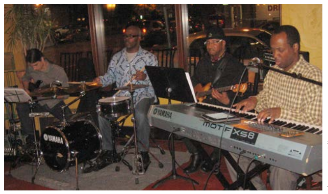
Back by popular demand, AKOUO will perform at Night on 48th.

In addition to those who donate to the silent auction, the neighborhood greatly appreciates the sponsors of Night on 48th who make this annual event a big success, even before the first guest has entered the door! Please thank our sponsors when you patronize their businesses.