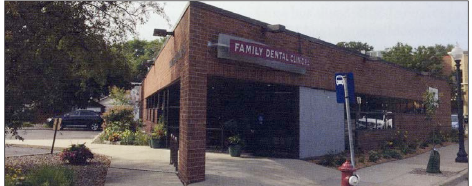
Family Dental Clinic had this distinctive building designed and built in our neighborhood in 1983.

Actually, the building has always been a dental practice, and was custom built in 1983 by an architect whose other projects included many regional shopping malls. Family Dental Clinic itself has deep roots in this neighborhood. More than half of our patients are "lifers," having come here as kids and continuing to as adults, even when they have to travel big distances to do so. There's a clear sense of community in our neighborhood, and it's an honor to get to practice dentistry in a small, women-run personal practice like this. Independent dental practices like this are a dying model, but we are thriving